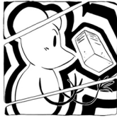
Ignatz Award Winner 2018